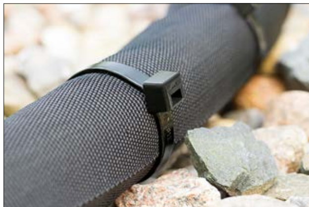
Impact resistant T-Series cable tie (PA66HIR(S)).