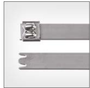
Stainless Steel Cable Ties, uncoated, MBT_XHS.