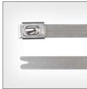
Stainless steel cable ties, uncoated, MBT_SS, MBT_HS.