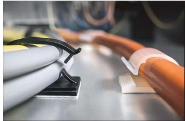
Self adhesive one piece fixing mounts RB20 (l) and RB14 (r).