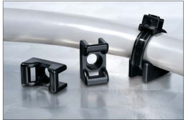
Cable Tie Mounts KR6G5, KR8G5 and CTM.