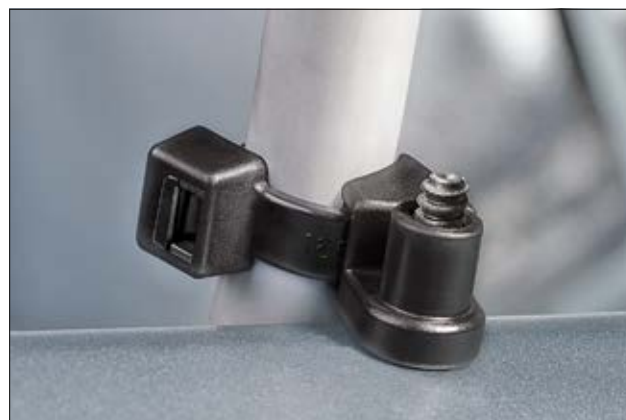
SBH2 allow cables to run at 90° to the panel.