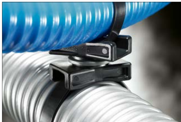
The spacers can be easily rotated by hand, allowing the bundles to be crossed and rotated at any angle.