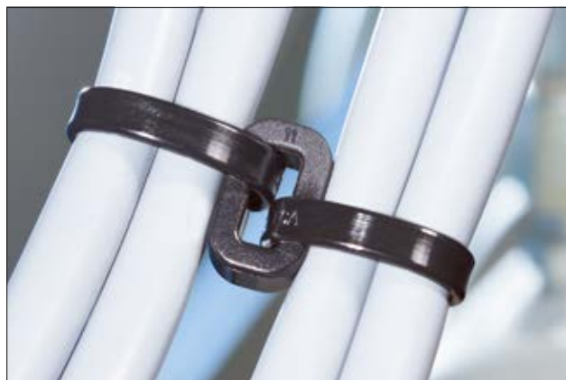
LOK04 ring for parallel routing.