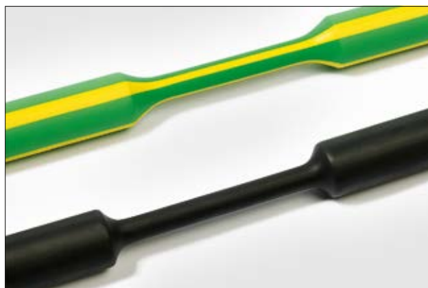
TREDUX shrinks a maximum of 3:1.