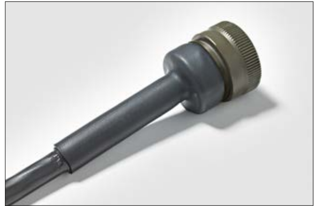
EPS300 and EPS400 offer high shrink ratios and protection against humidity.