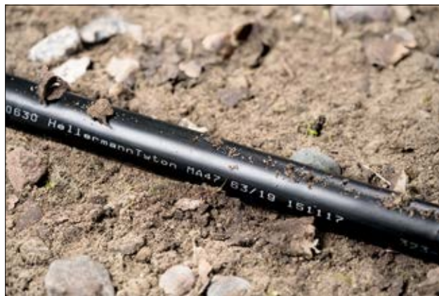
MA47 for above and below ground.