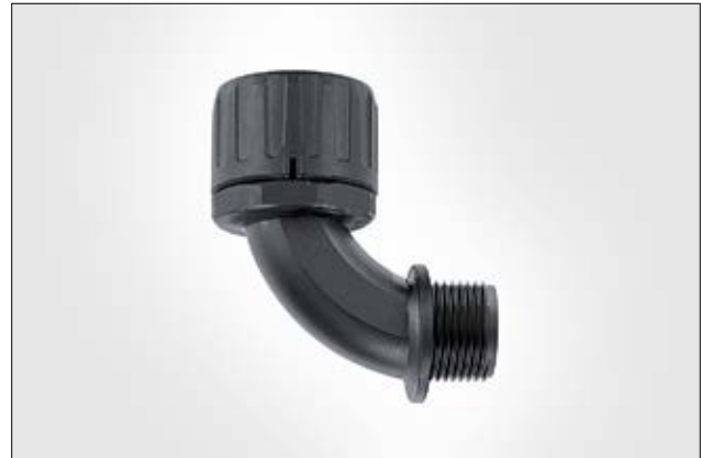
HelaGuard HG-90 90° Elbow, IP66.

Fittings with PG and swivel threads are also available. For our complete range of conduits and fittings, please see our HelaGuard catalogue.