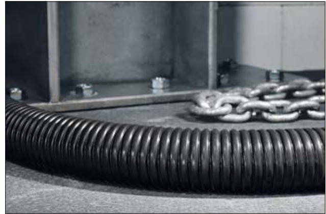
HelaGuard PCS Galvanised Steel Conduit with PVC Coating.