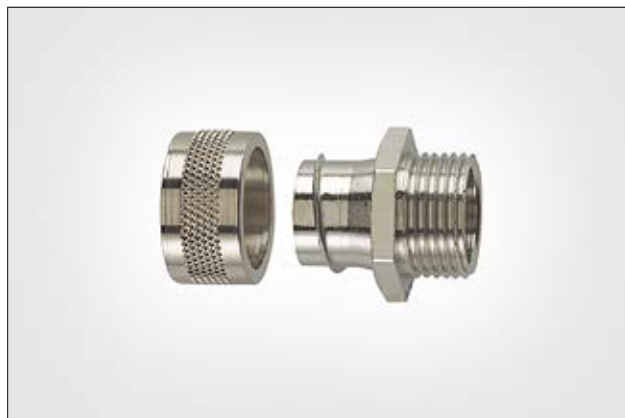
HelaGuard PCS-FM Fixed External Thread.

Fittings with PG and swivel threads are also available. For our complete range of conduits and fittings, please see our HelaGuard catalogue.