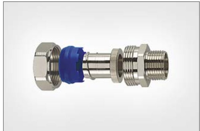
HeloGuard PCS-FMC Compression Fitting.