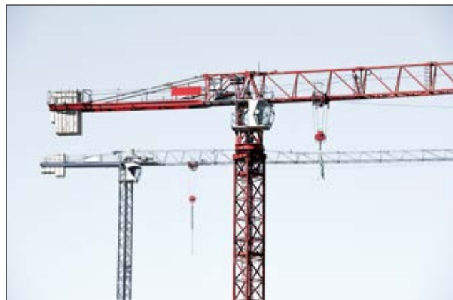
HelaGuard LTS galvanised steel conduit with a smooth, liquid-tight PVC cover is ideal for outdoor installations.