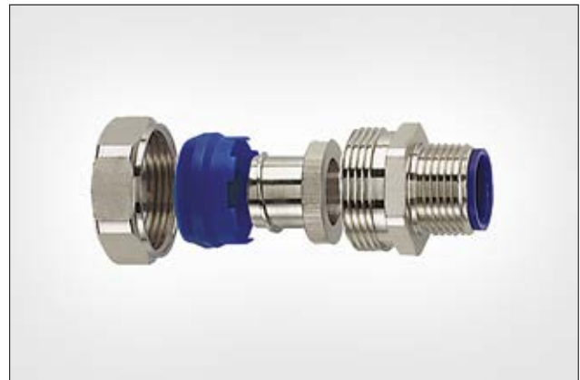
HelaGuard LTS-FMC Compression Fitting.