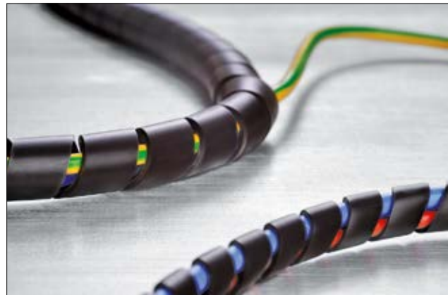
Spiral binding SBPAV0.