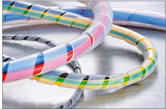
Spiral binding SBTFE is ideal for extreme conditions.