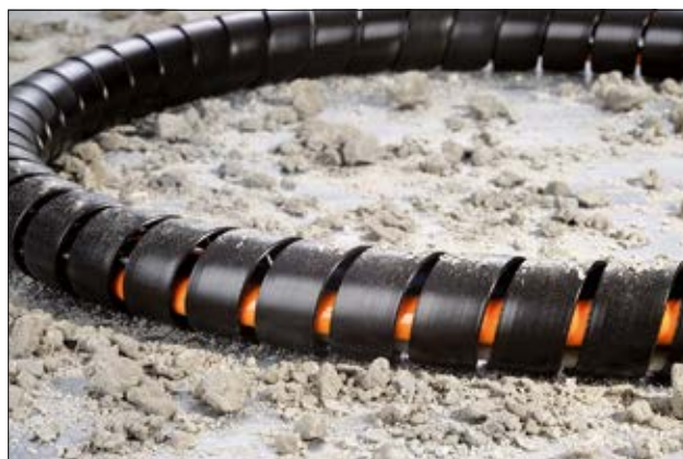
SPF spiral binding is extremely robust and abrasion resistant.