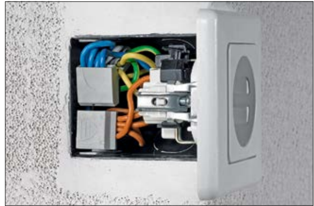
The compact design of HelaCon Easy fits perfectly in tight spaces.