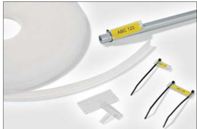
Multi-purpose identification potential: Helafix HC and HCR.