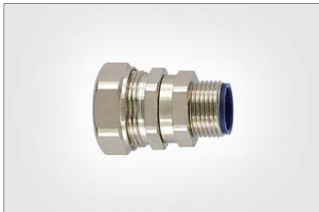
HeliaGuard LTS-SMC Swivel Compression Fitting.