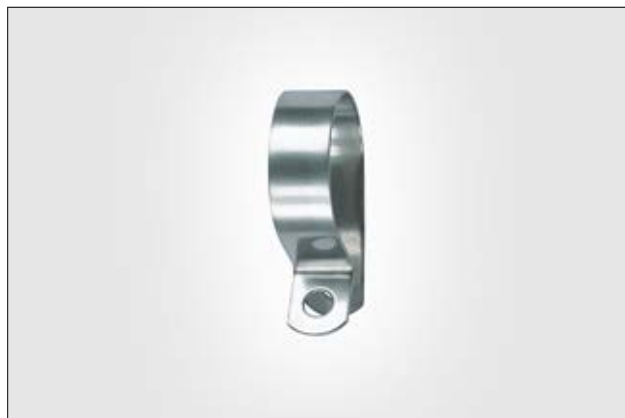
HelaGuard AFCSS Fixing Clip, Stainless Steel.

The AFCSS P-clip is used to secure metallic conduits.